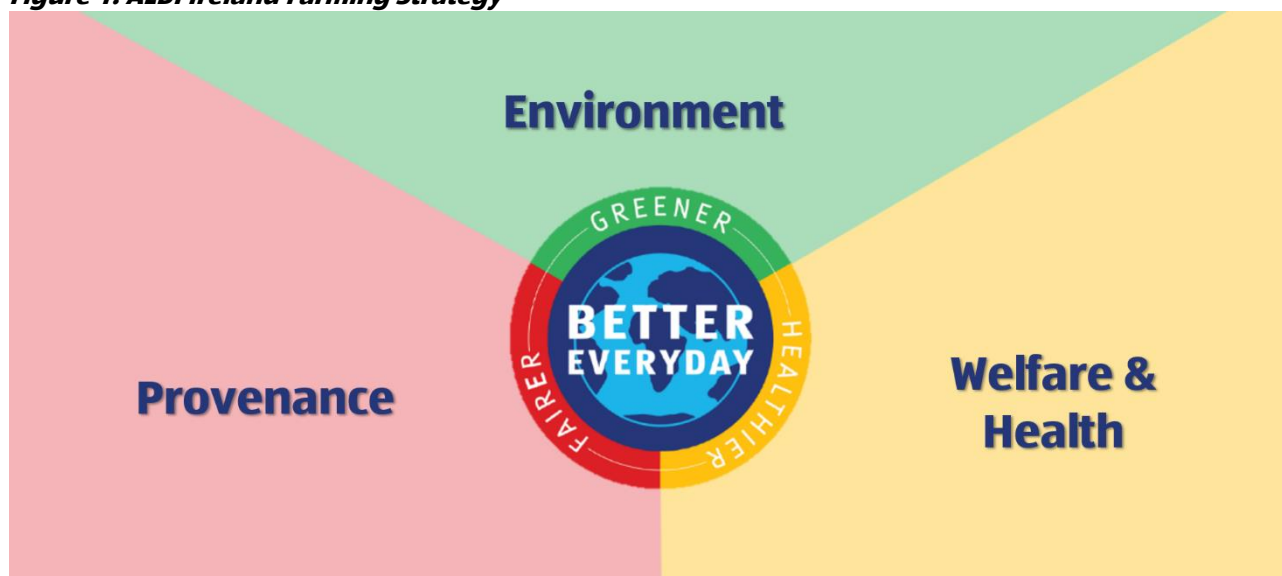
Figure 1: ALDI Ireland Farming Strategy

Animal welfare is an important part of being a responsible business and we are committed to high standards of welfare for animals used in both our food and non-food products. We believe that a model of continuous improvement is the most appropriate route towards delivery of our animal welfare goals.